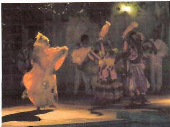
Dancer representing Ochún

The largest of these is Santerian, and it has the official blessing of the Cuban government. Approximately 88% of the Cuban population are practicing Santerians which blend the elements of Catholicism with West African beliefs. Historically, it allowed plantation slaves to appear to be Catholic while maintaining their cultural practices.