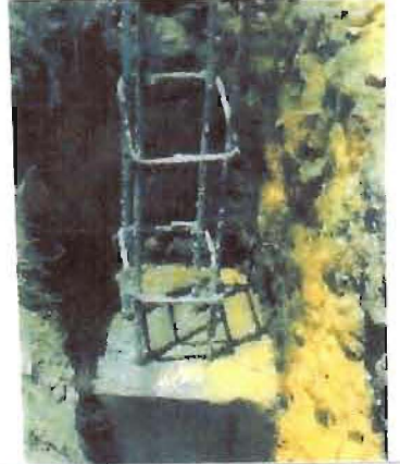
The cement was mixed on the ground, then shoveled into wooden and re-bar structure supports.