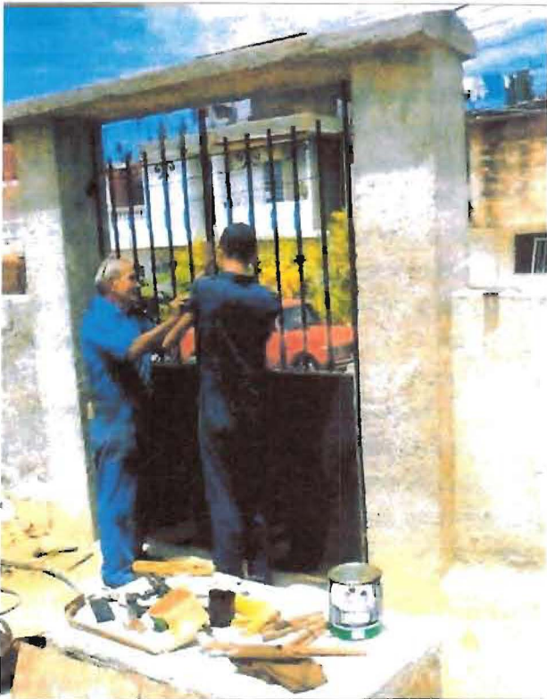
Finally, a gate is installed in the support pillars, and the work on the two-story building inside continues.