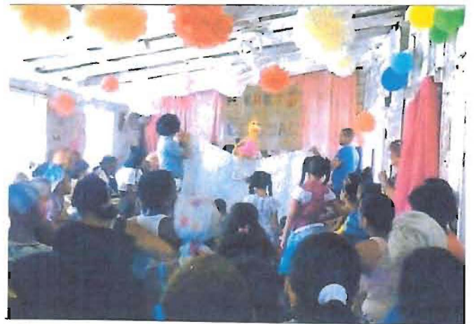
The children are treated to a Puppet Show, which is followed by a craft class about the Bible story.

The Lord supplies the needs of His people. The ministers that attend the seminars require a large amount of food during their two week studies. This catfish went a long way towards supplying those meals. In Cuba, the construction, craft supplies, and refreshments come from donations.