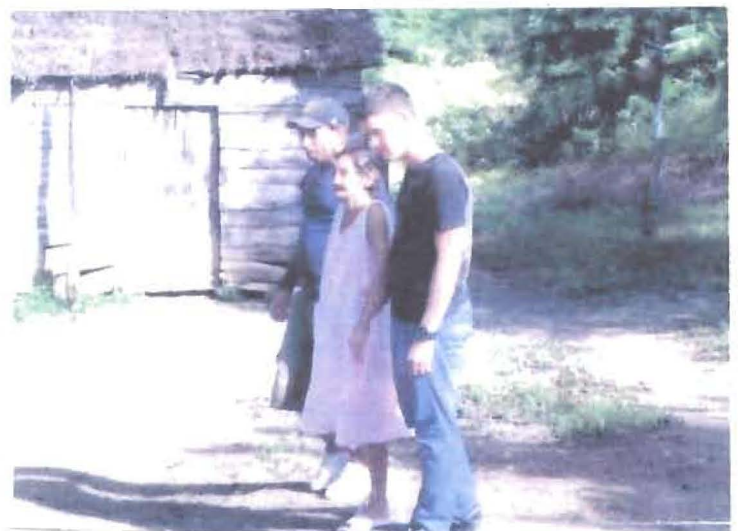
Ministering to the elderly in rural areas