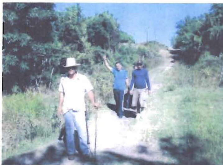
Church planting on eastern side of island