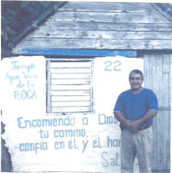
Templo Agua Viva de la Roca Living Water of the Rock Church