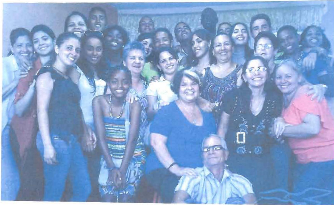
Genes congregation in Havana.